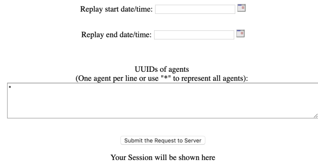
Fig. 4: Stream replayer

Demonstration Procedure. We start the demonstration by constructing and executing the SAQL queries using a command-line UI (Figure 3). As we perform the attack, the